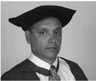
Dean of Māori and Pacific Development