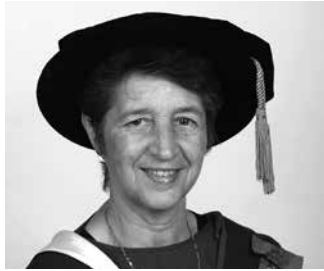
Dean of Engineering (Acting)