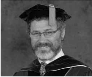
Dean of Science